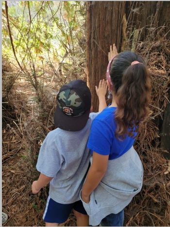
Students visiting the Carmel River Watershed from Mission Park School in Salinas

CRWC directed another successful Watershed Education Program during the 2021-2022 school year, with 27 in person field trips and 9 virtual sessions. Facilitated in partnership with the Santa Lucia Conservancy, the program hosted a total 867 visitors, of which 665 were schoolchildren. The Watershed Education Program served groups from all over the Monterey region, including Carmel and Salinas.