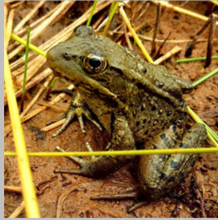
California Red-legged Frog.