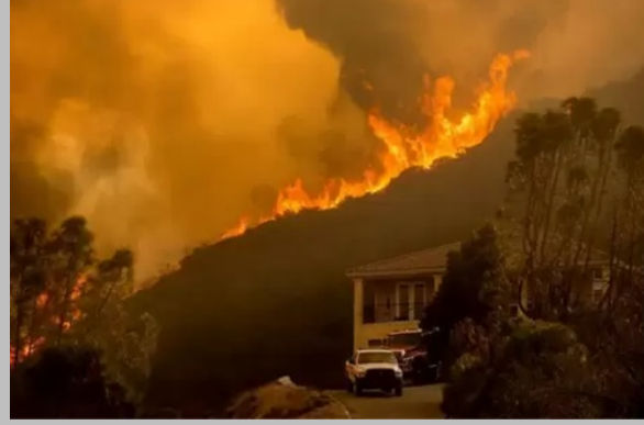
River Fire near Salinas, 2021.

history. These conditions have prompted CAL FIRE to suspend all burn permits in Monterey and Santa Cruz counties. It is imperative to take the necessary precautions to protect ourselves and others from the threat of wildfire.