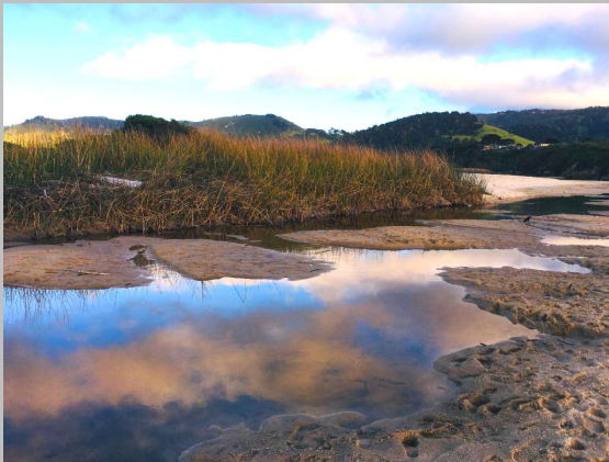
Carmel River Wetlands