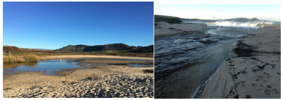
(Site: Carmel River State Beach)