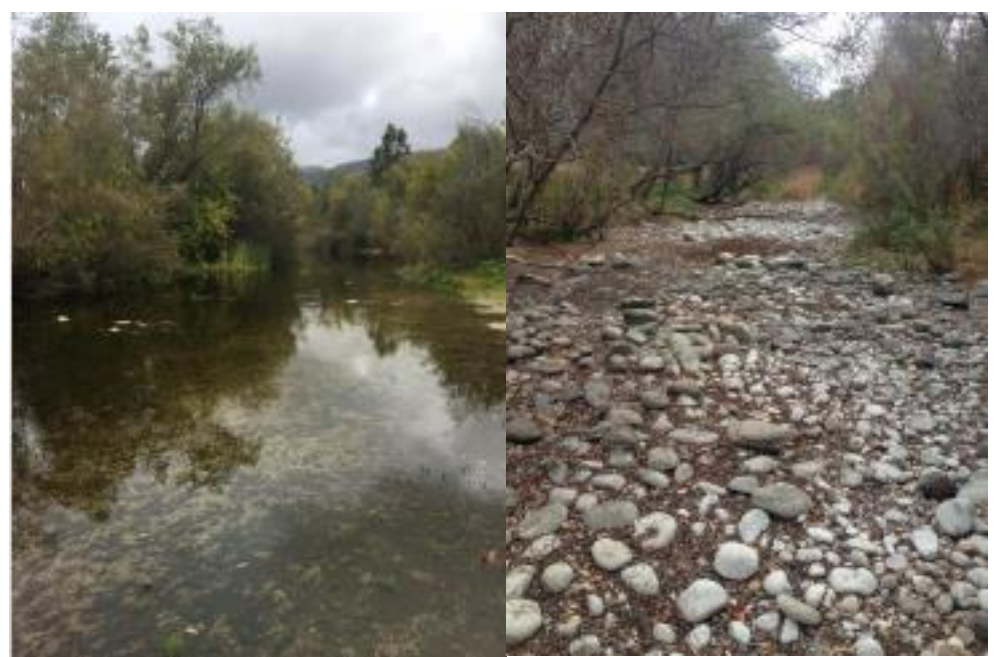
(Site: de Dampierre Park, Carmel Valley)

4. The living river. The course, water level and connectivity of Carmel River change throughout the year. Look at the pictures of Carmel River and the Lagoon in summer months and winter months. What are the differences? What do these changes mean for the lives in the watershed? Answer down below.